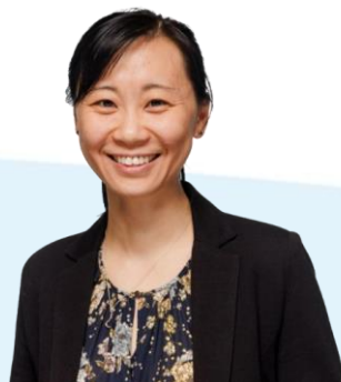
Xue Feng Edu. Fund. Cttee Chair