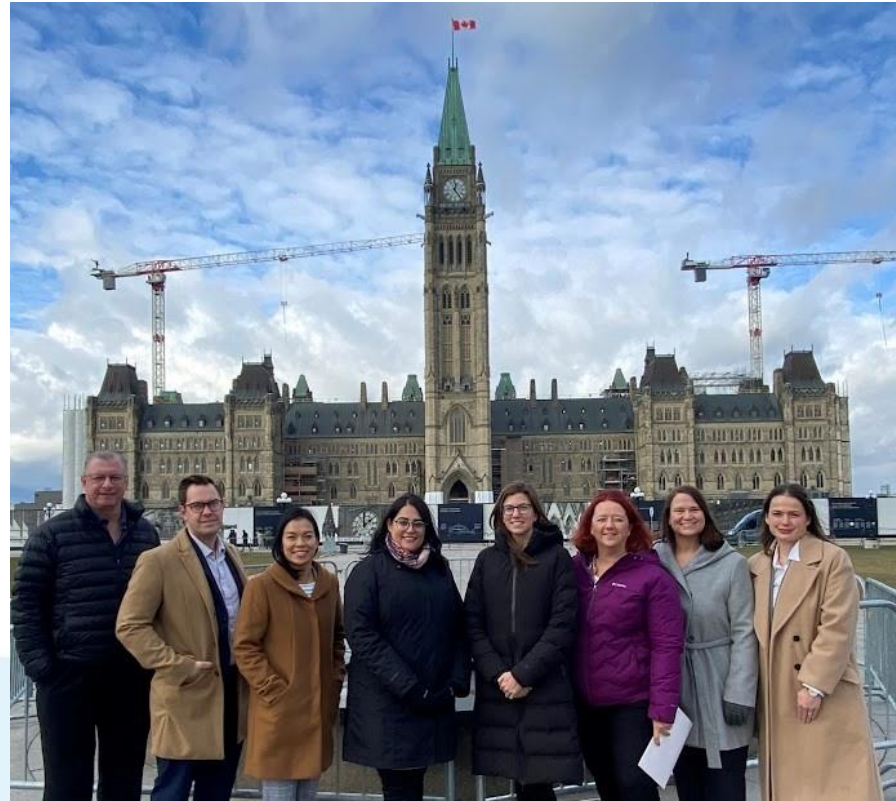
Lobby Day, Ottawa, Ontario – 2023 Members of the Board and Advocacy Committee